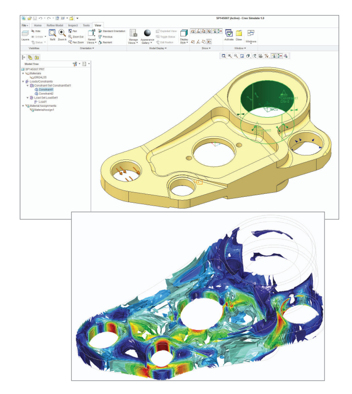
Setting up analysis constraints is fast and easy.